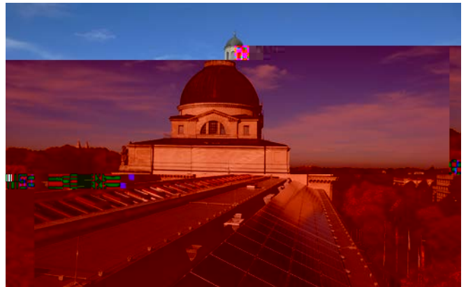
PC05 Trina Solar modules.

Tradition and modernity go hand in hand in Bavaria – and that also goes for the energy system and supply in this economically-strong Southeastern German state. The Bavarian State Chancellery, official residence of Horst Seehofer, Prime Minister of the State of Bavaria, is supplied with solar energy from a PV array. Covering a roof area of 800 square metres, the array generates 70 MWh of solar electricity, which is used by the State Chancellery directly. OneSolar International, a project developer for PV systems and wholesaler for solar products, installed the PV system on the heritage-protected building, using, 296 TSM-